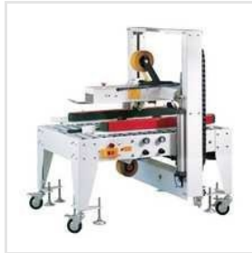
Automatic Carton Sealing Machine