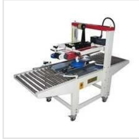
Carton Tapping Sealing Machine