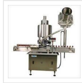
Automatic Capping Machine