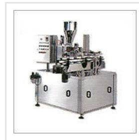
Rotary Cup Filling Machine