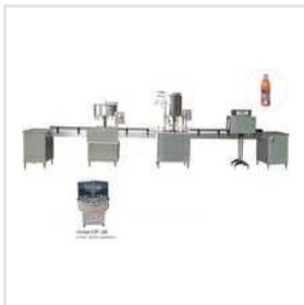
Automatic Bottle Washing Machine