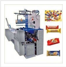
Biscuit Packing Machine