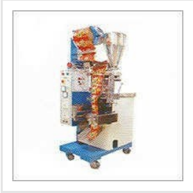
Cup Filler FFS Machine