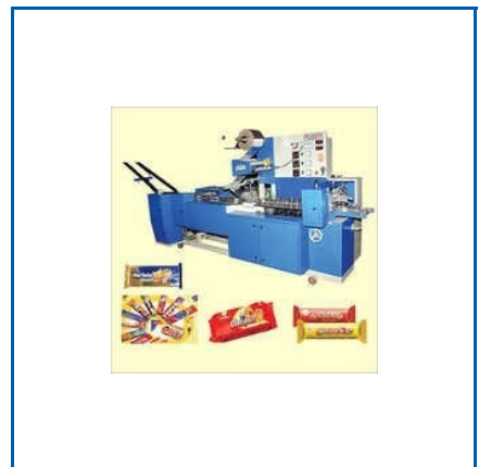
AUTOMATIC FLOW WRAPPING MACHINE