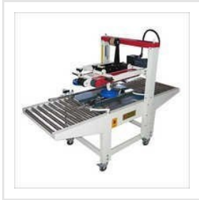
Carton Sealing Machine