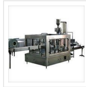
Automatic Rinsing Filling Capping