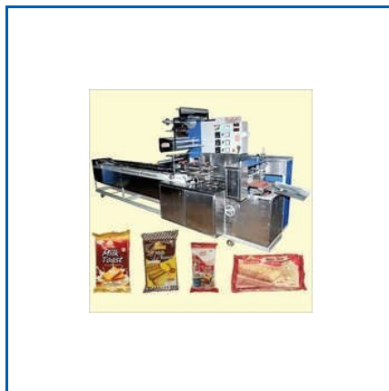
FLOW WRAP MACHINE