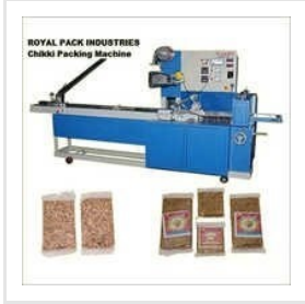
Chikki Packing Machine