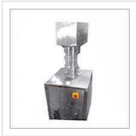
Semi Automatic Capping Machine