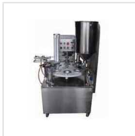
Semi Automatic Liquid Filling Sealing Machine