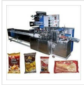
Toast Flow Wrap Packaging Machines