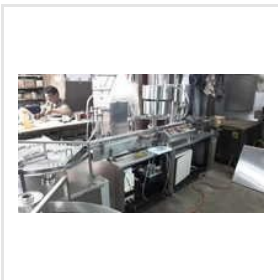
Automatic Bottle Filling Machine