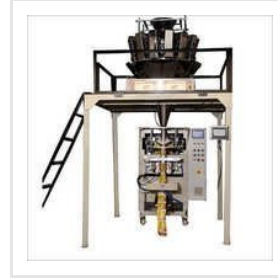
Automatic Ffs Machine